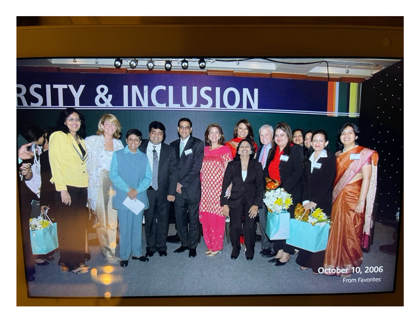
Thanks for the memories

EPIC! Rule #19: The key to an EPIC! life is to know that life is happening "for" you, not "to" you.