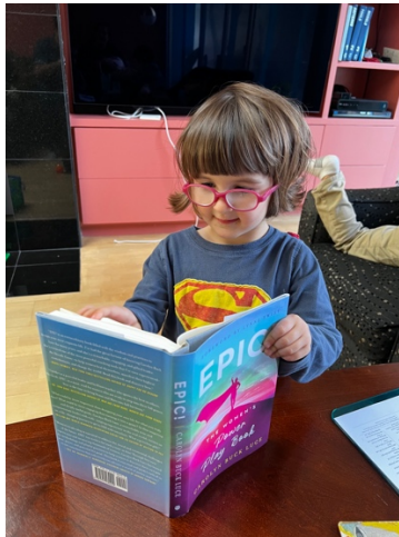
The Power of a Name

EPIC! Rule #16: If you name it, you can claim it (and charge for it!)